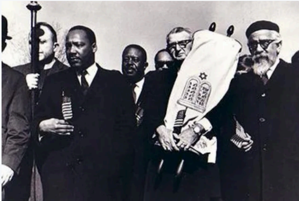
Rev. Dr. Martin Luther King, Jr., Rabbi Maurice Eisendrath (former President of the UAHC, our denomination), and Rabbi Abraham Joshua Heschel (Rev. Ralph Abernathy bet. MLK & Eisendrath)